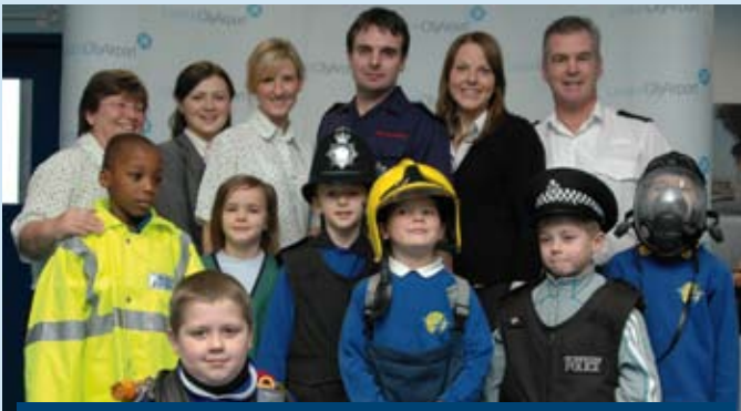
Britannia Village Primary School students visiting London City Airport

In January, 50 year three students from Britannia Village Primary School visited London City Airport as part of their Citizenship Week Programme. Through visiting the Airport the students had the opportunity to learn and understand how to achieve economic well-being.